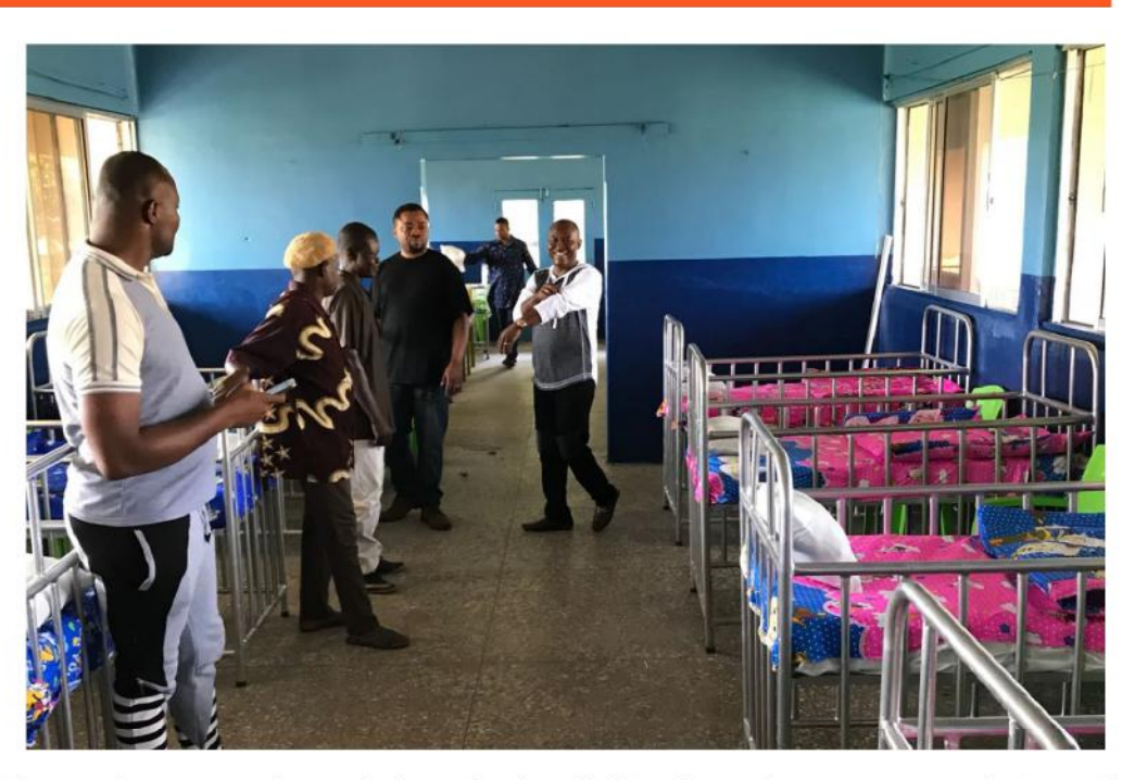
The newly renovated Uzuakoli motherless babies home by Hopee Foundation Int'l

In fulfilment of its promises, HOPEE Foundation Int'l handed over the newly renovated Motherless babies home to the management of the home. HOPEE Foundation also visits the King of Uzuakoli on the day of hand over of the newly renovated motherless babies home Uzuakoli. The vision of HOPEE FOUNDATION INTERNATIONAL is to be an anchor organization that will focus on changing lives and making a difference in our community and be an extended arms and voice for the less