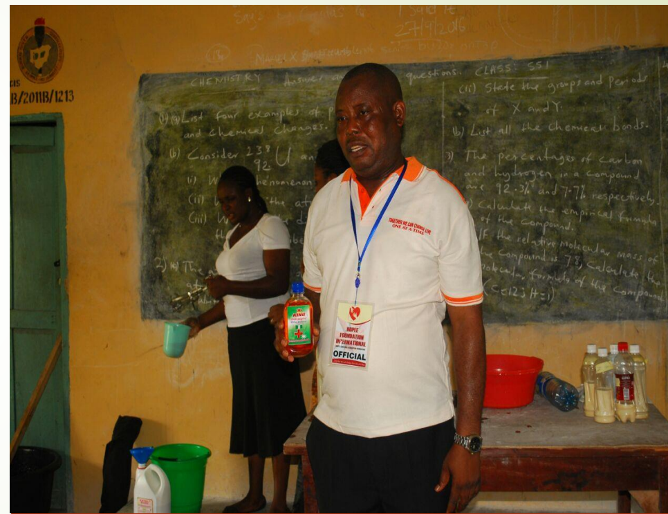
SOAP & DISINFECTANTS MAKING 4