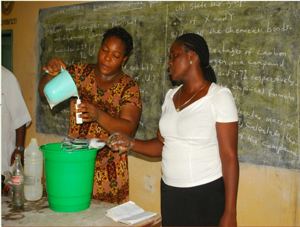
SOAP & DISINFECTANTS MAKING 1