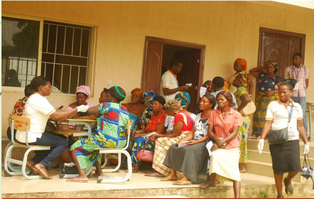
MEDICAL MISSION OF HOPEE FOUNDATION INT'L

Drugs prescribed by the Doctors were dispensed. HOPEE Foundation was able to attract 35 nurses, 8 Doctors, 4 Lab Scientists, 2 Pharmacists and some medical attendants to assist in drug dispensation.