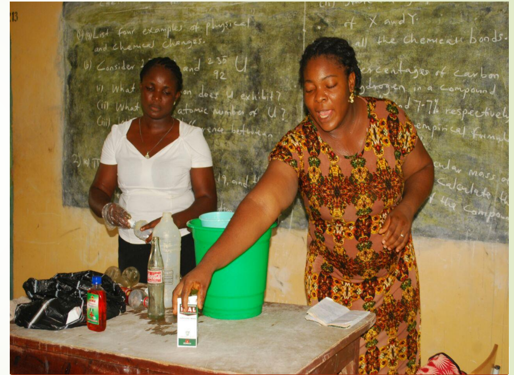
SOAP & DISINFECTANTS MAKING 2