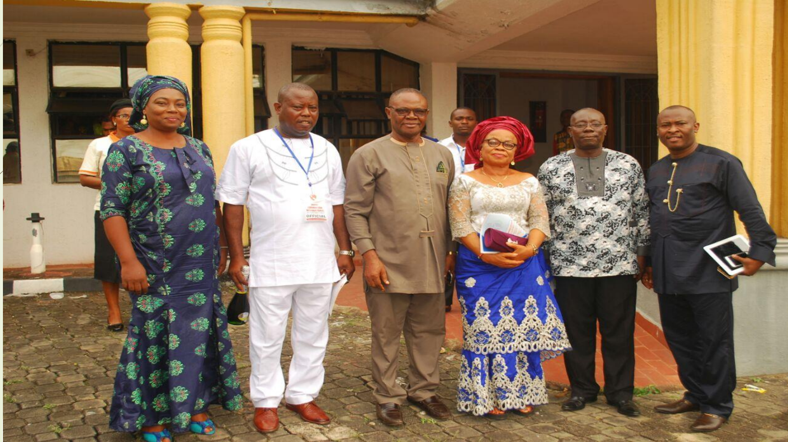
THE CHAIRMAN OF THE OCCASION THIRD LEFT AND COMMISSIONER OF WOMEN AFFAIR ABIA STATE THIRD RIGHT AND FIRST RIGHT FOUNDER HOPEE FOUNDATION

Finally on the fourth day which was the official inauguration of the foundation was witnessed the by commissioner for women affairs Abia State, who in her capacity represented the Governor of Abia State. Stated that all she has seen were encouraging and noted that the vision of the Foundation were similar to the programs of HER Excellency and promise to pass the message across.