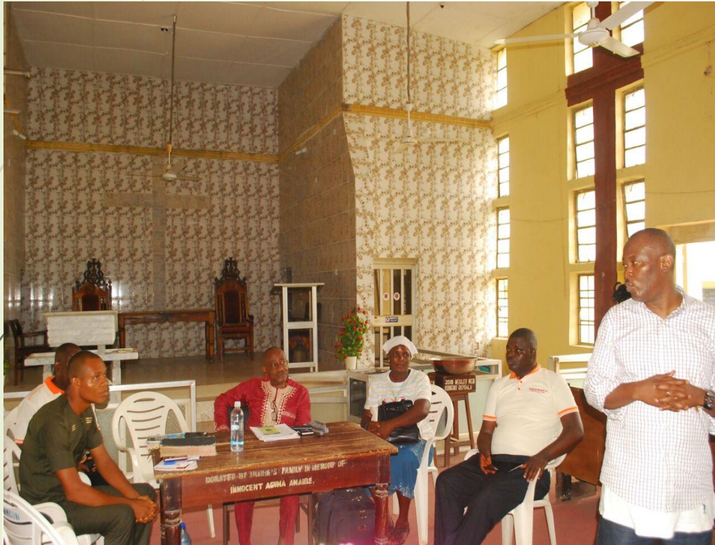
PRINCE MADU GABRIEL AND HOPEE FOUNDATION MEMBERS