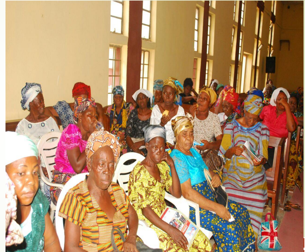
CROSS SECTION OF WIDOWS