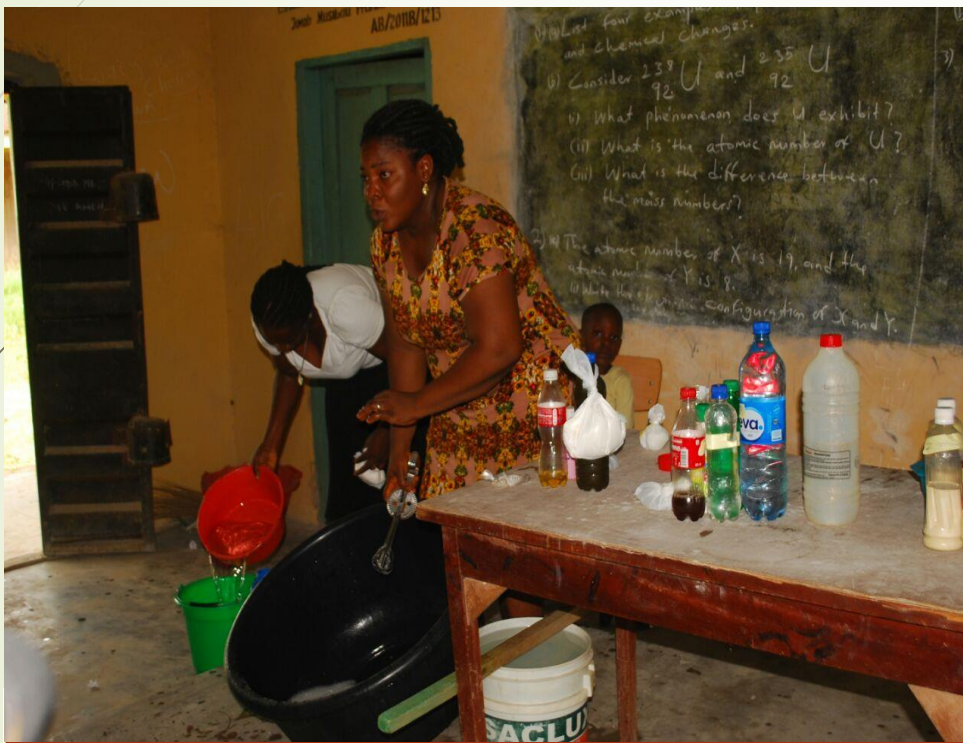
SOAP & DISINFECTANTS MAKING 3