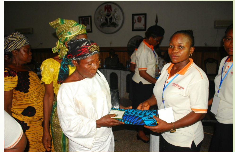
PRESENTATION OF GIFTS TO THE WIDOWS