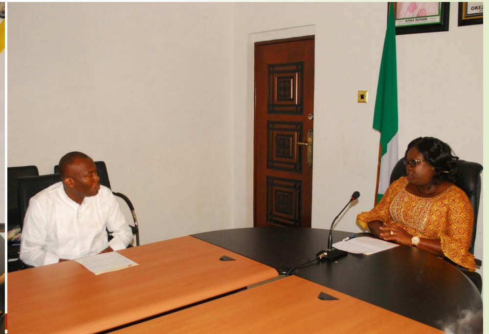
WITH ABIA STATE GOVERNORS WIFE ON A ROUND TABLE DISCUSSION