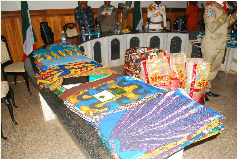
GIFTS FOR THE WIDOWS

The second day was so remarkable in the lives of the widows who were empowered on how to make virilities of products like soap, cosmetics and agricultural farming in a modern approach perspective. Not minding their number all the 150 widows in attendance did not leave without toiletries, soap and cloths.