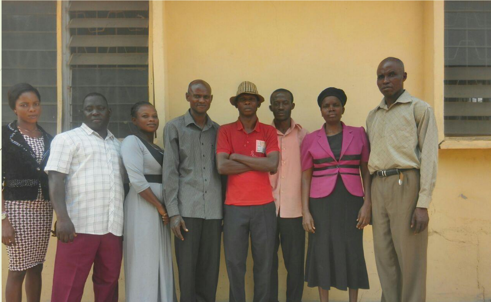
HOPEE FOUNDATION INTERNATIONAL, EKITI BRANCH