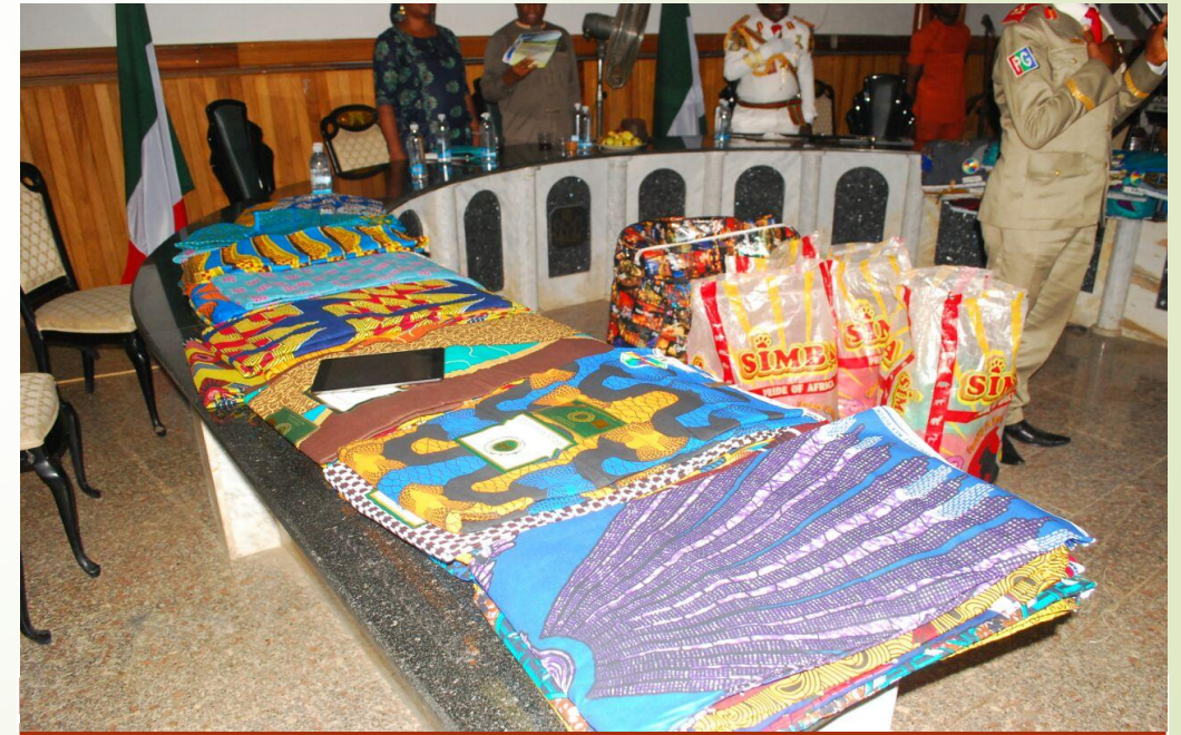
GIFTS FOR THE WIDOWS