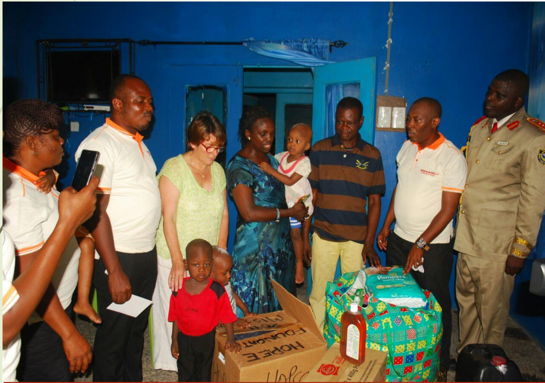
Cross section of the home presentation of gifts to the Orphanage Home

The event that sparked the light started on the 1 st of December to 4 th drew a lot of attention, with a visit to two motherless baby homes where gifts ranging from clothes, shoes, toiletries and food items were distributed. Ahiake motherless baby home and Ozoakoli motherless baby home. At Uzoakoli, the situation on ground was very sympathetic to which the founder of the foundation shed tears on what he saw with his eyes.